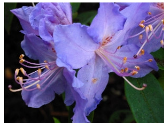
R. augustinii VG

3 Beautiful Trusses entered into our show