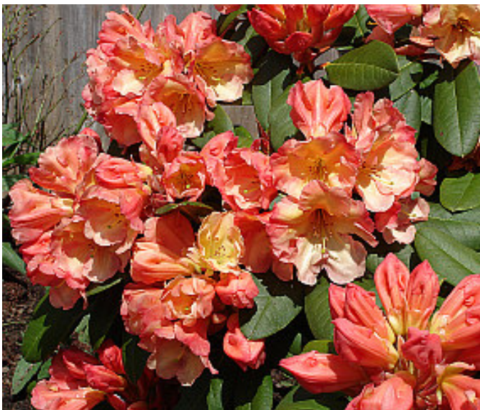
"Honey Butter in my garden"