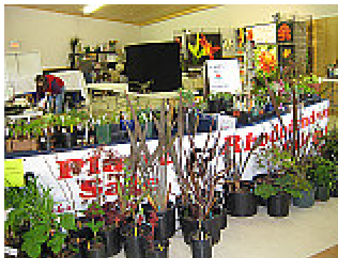
Before they disappeared.

The final tally is not complete, but word is that the sale was even better than last year.