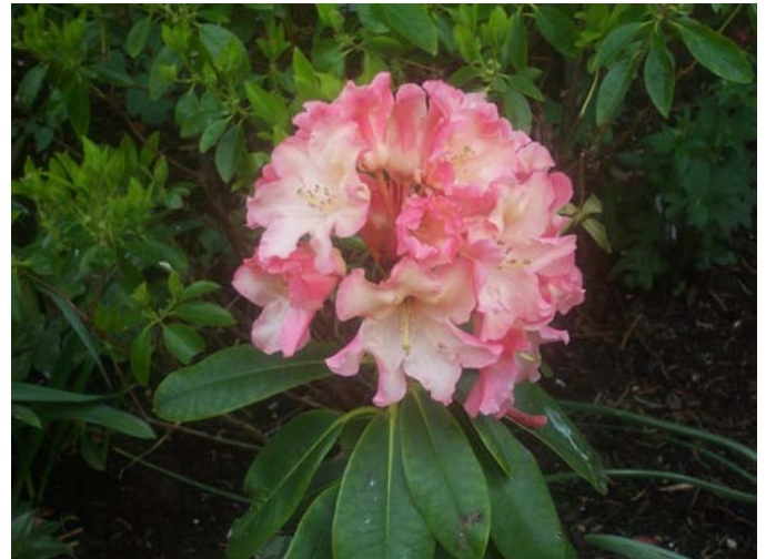
Rhododendron 'Lem's Cameo'

Cadboro Bay United Church Hall 2625 Arbutus Road, Victoria