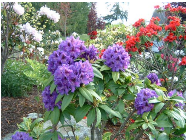
2. R. 'Blue Boy' is long-blooming and reliable with a terrific purple blotch.