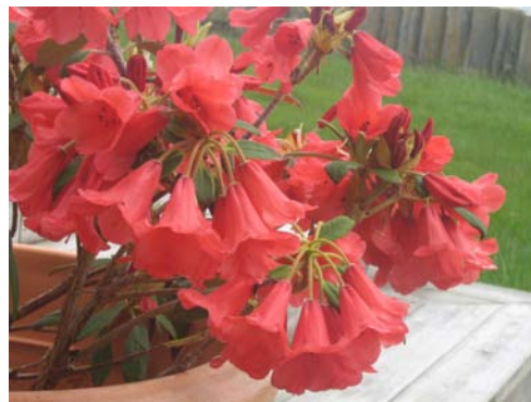
Rhododendron 'May Day'