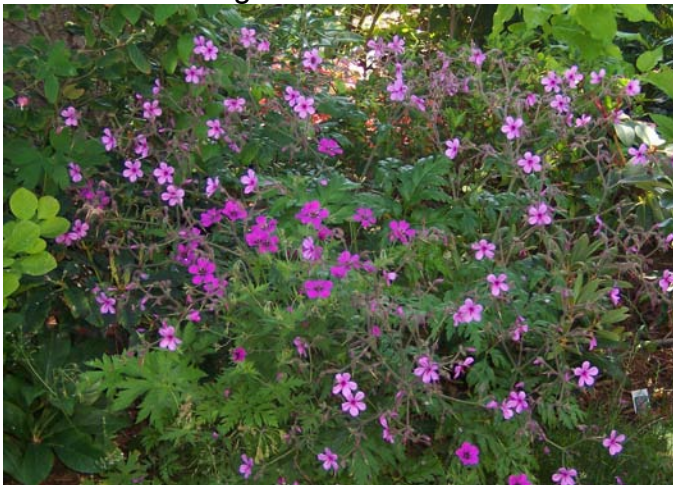
Hardy Geraniums bloom all summer and into Fall and make a great companion for rhododendrons.

And it is now time to pick the remainder of the tomatoes....think I'll make some Bruschetta for a taste treat tonight!!