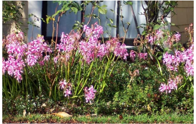
Nerine bowdenii in a Victoria late-summer garden.