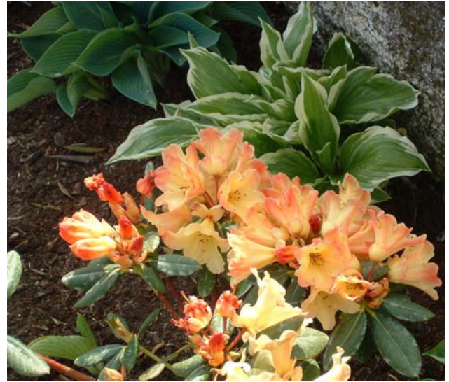
3. R. 'Nancy Evans' is a lovely two-toned orange with some September flowers