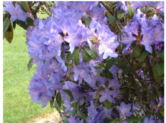
4. R. 'Mood Indigo' x augustinii – This is a very early blooming mauve shrub now 7 feet tall.