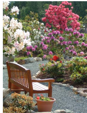
R. 'Cherry Float' - spectacular, brilliant pink