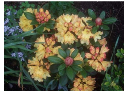
Rhododendron 'Nancy Evans'