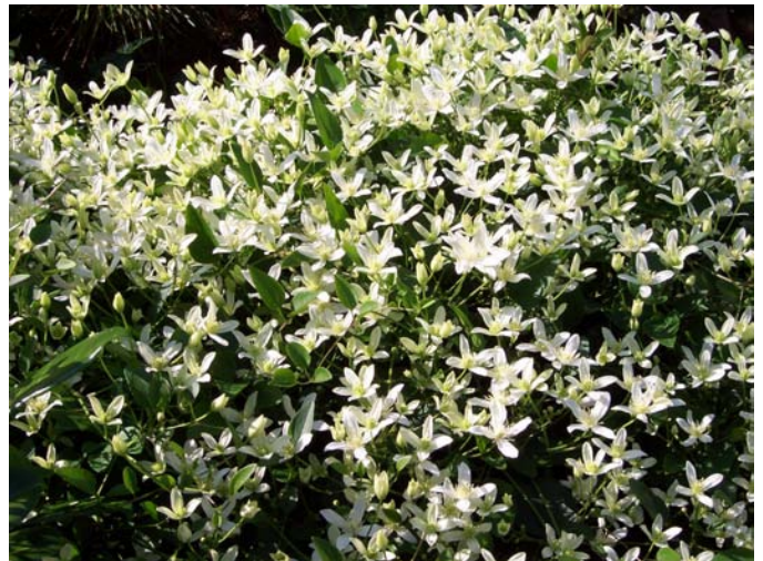
Clematis maximowicziana (Sweet Autumn Clematis) is blooming now.