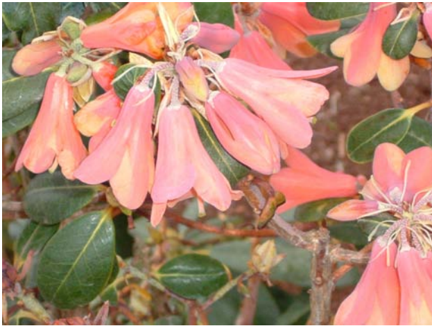
1. R. 'Biskra' x 'Conroy' – lovely, scented foliage with an elegant orange/yellow tubular flower.

This time, we visit the garden of Jim and Ellen Rothwell in Qualicum Beach.