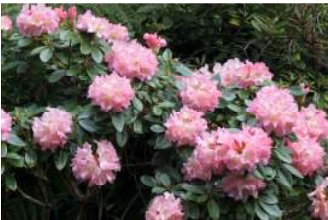
This robust pink was found growing in the rainforest of Pukeiti.