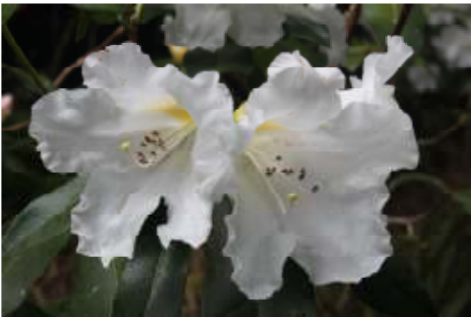
This lovely is Rhododendron formosum var. inaequale . It is a Maddenia, so somewhat tender in a hard winter here in BC. Maddenii grow prolifically all over New Zealand. Many are delightfully fragrant such as R. lindleyii , R. Iyi and R. johnstoneanum .