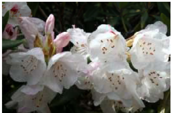
Rhododendron morii is native to Taiwan and fully hardy here on Vancouver Island.