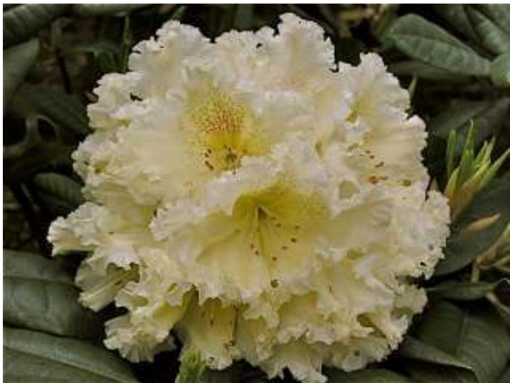
Rhododendron 'Champagne Lace'

Internationally-recognized speakers from Scotland, France, Germany and China are just a few of the 'thrills' scheduled for the ARS 2015 Convention in Sidney, BC.