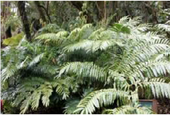
Ferns abound in New Zealand, but none so large as Ptisana salicina , the largest ground fern in New Zealand with fronds that can reach five metres. Rare and declining in many areas of NZ, they are thriving at Pukeiti.