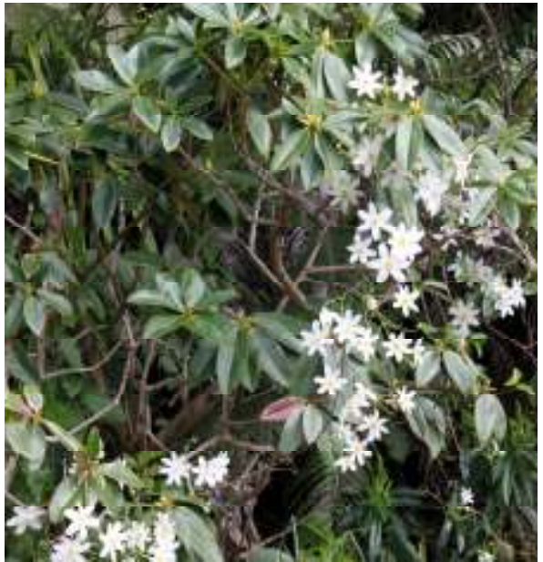
This rhododendron seemed content to play host to the New Zealand native Clematis paniculata that was found growing up and through many of the rhododendrons in the garden.