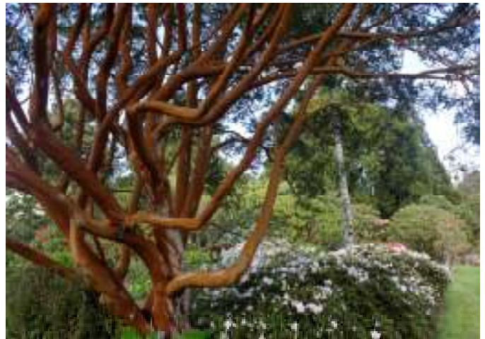
The bark and fascinating branching of this Luma apiculata graced a main path at Pukeiti.