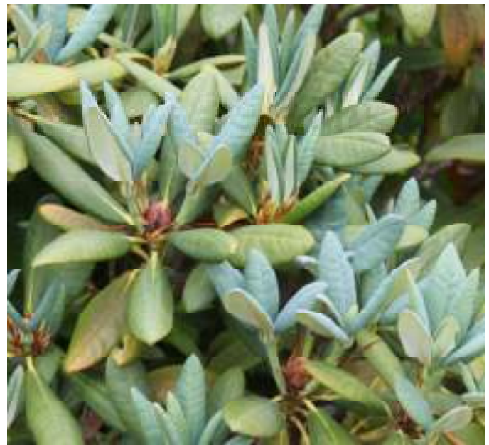
Leaves are very important – and few so attractive as Rhododendron pachysanthum seen here in the England garden.