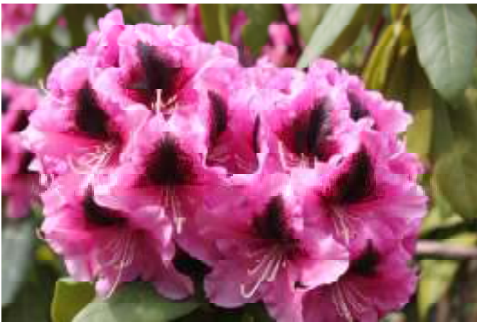
Rhododendron 'Chapeau' at the Jamieson garden