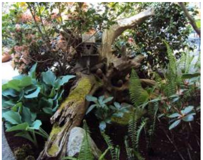
Shady narrow side gardens can be beautiful too!