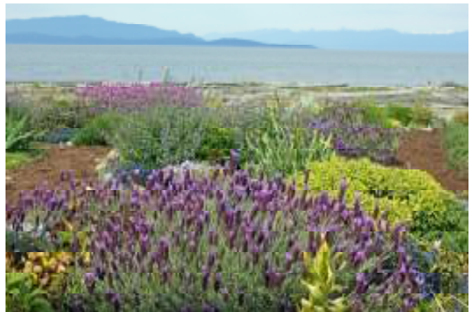
And on the seaside, a beautiful xeriscape, low maintenance garden that enhances the spectacular sea view.