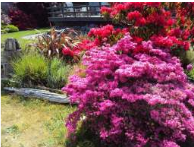
Seaside rhododendrons and azaleas at Columbia Beach