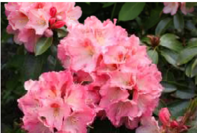
Rhododendron 'Coral Mist' can sometimes be fussy – but here in the England garden it is a stunning beauty!