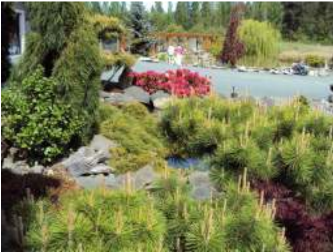
A large acreage has sweeping views and interesting features.