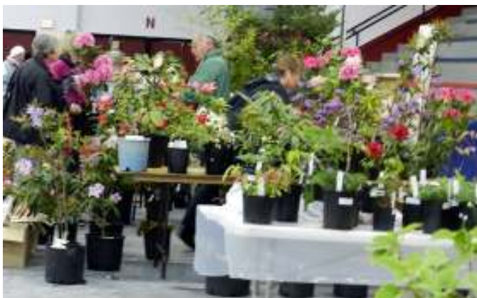
Great plants for sale!!