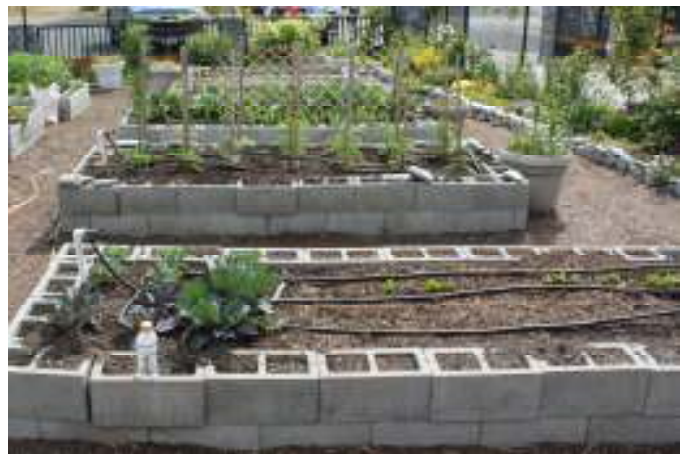
These raised vegetable beds take advantage of the sunny south side on Mariner Way in Parksville – lots of veggies are being produced here!