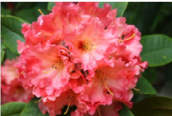
Rhododendron 'Rimshot' at the Jamieson garden – a real beauty!