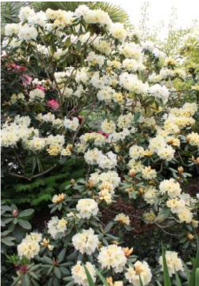
This unknown healthy specimen was a gift from a neighbour to the garden owner many years ago – a hybrid seedling perhaps of Rhododendron elliottii .