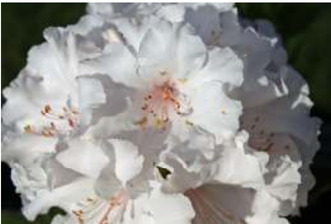
Rhododendron 'Spring Fragrance' is a hybrid of Frank Fujioka. Huge pink buds open white with a subtle fragrance – and the leaves are a dark green, wavy and very attractive.