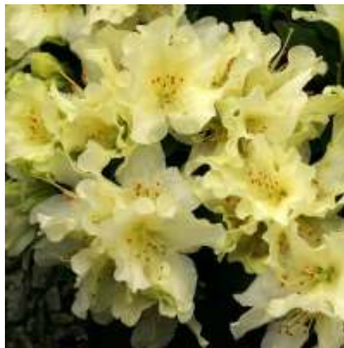
Rhododendron 'Patty Bee' is a favourite of the rock gardener.