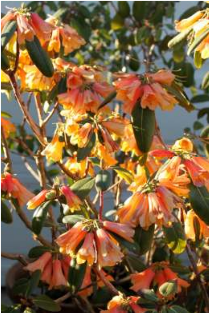
Rhododendron 'Conroy' catching the last rays of the sun