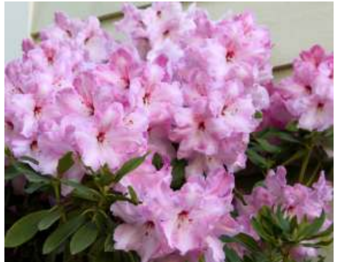
Rhododendron 'Cotton Candy' – a large shrub almost touching the eaves!