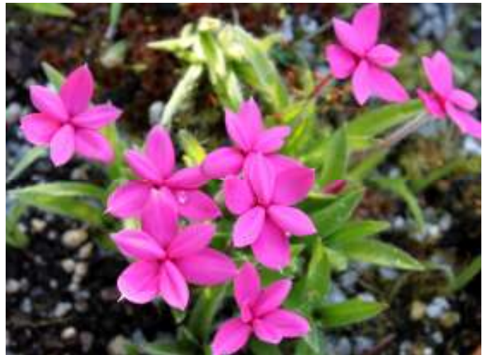
Rhodohypoxis is happy in very well-drained soil amended with grit and perlite. Best to overwinter in a cool greenhouse.