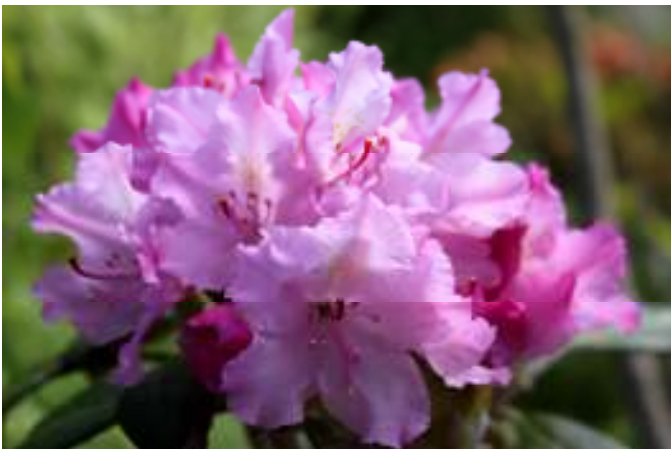
Rhododendron smirnowii has lovely mauve/pink blossoms and white indumentum on the leaves.