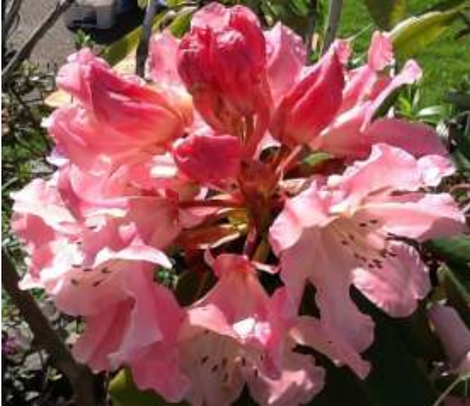
Rhododendron 'Lem's Cameo' in the garden of John and Arlene England – certainly one of the most beautiful hybrids ever!