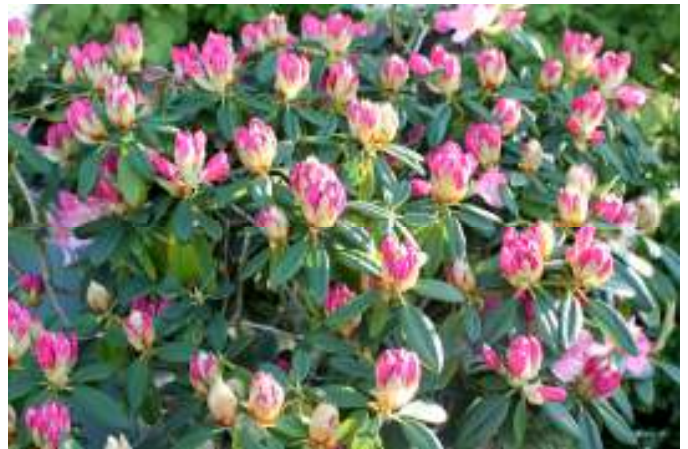
Rhododendron 'Percy Wiseman' waiting to bloom proves that rhododendrons have many beautiful stages – from bud to blossom to new leaves!!