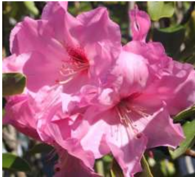
Rhododendron 'Qualicum's Pride'