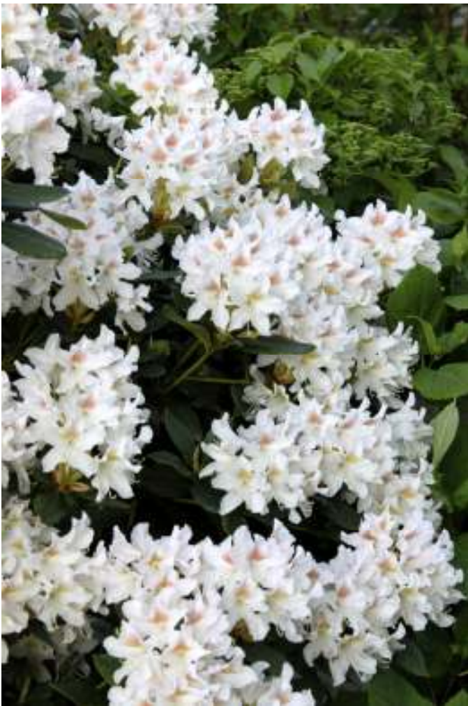
Rhododendron 'Cunningham's White' is one of the new "ironclads" – standing a few feet from the ocean and cold north winds, this lovely plant never fails to bloom and looks good all year.