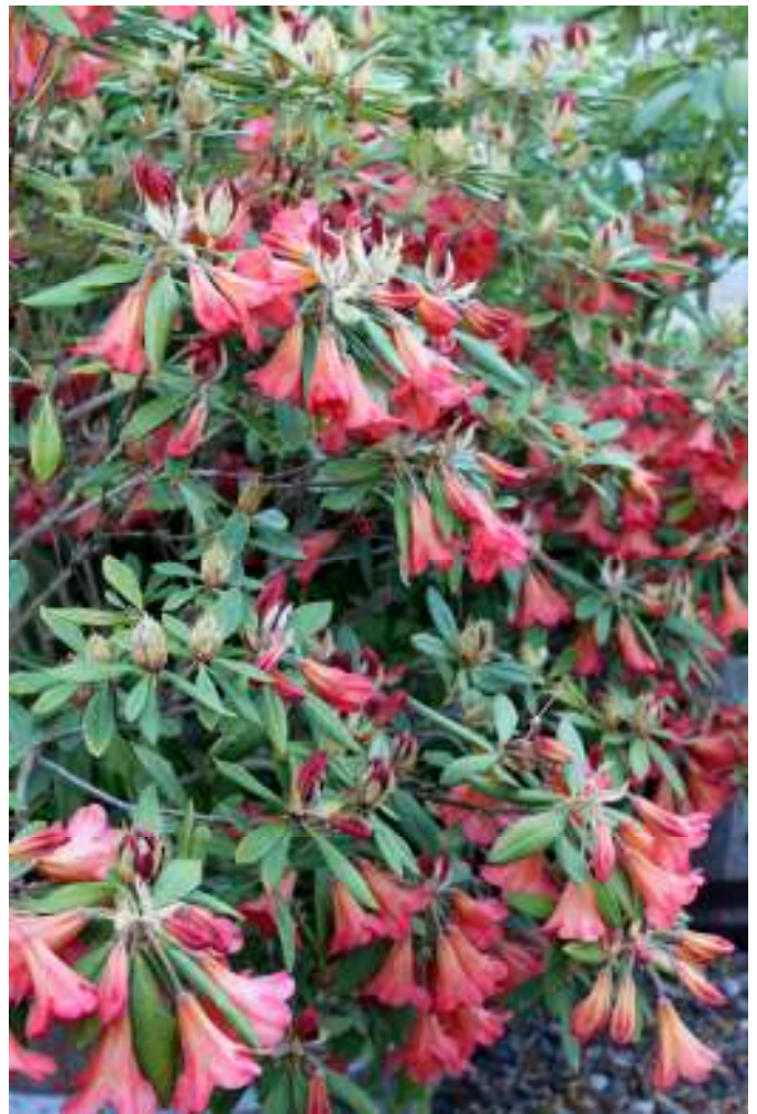
Rhododendron 'Medusa' is a prolific bloomer over a long period of time. Luscious orange/coral blooms clothe this attractive plant making new fans each spring.