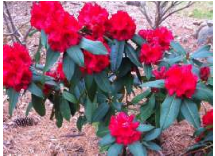
Rhododendron 'Taurus' looking pretty happy in the garden of Kathy and Guy Loyer.

The plants and birds were photographed by their owners.