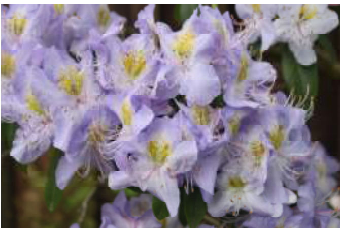
This lovely mauve rhododendron was a prolific bloomer at Lindenfield near Dunedin, New Zealand.