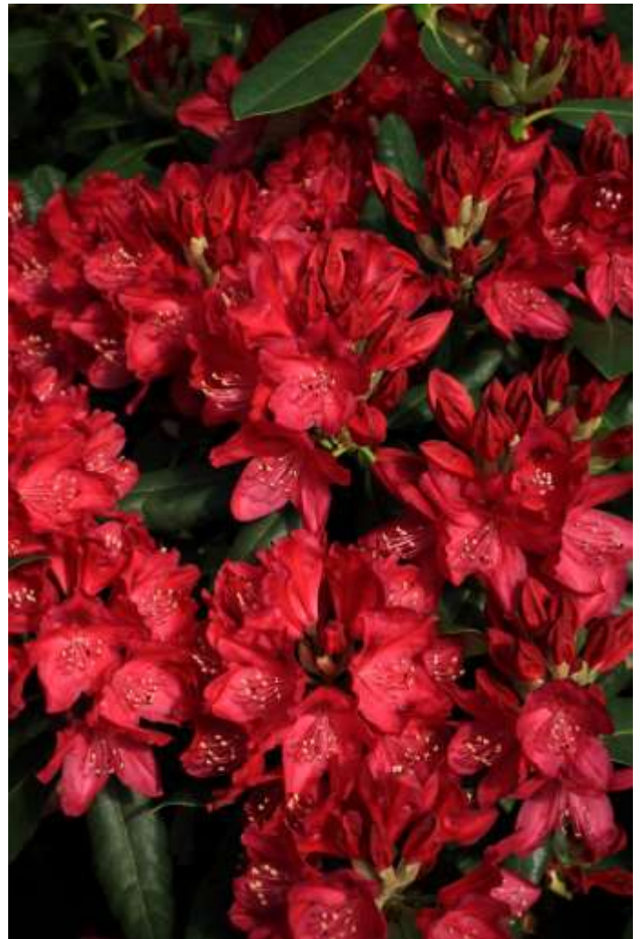
Rhododendron 'Nova Zembla' blooming at the Hachman Nursery near Bremen, Germany during the ARS 2018 Spring Convention. Hardy and vigorous, 'Nova Zembla' has lovely foliage in addition to these showy scarlet flowers.